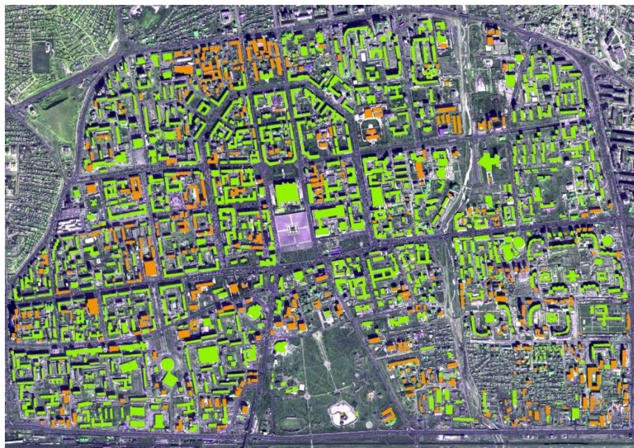
Figure 4. The updated map of Ikh toiruu, 2009 (light brown represents the buildings built after 2000).