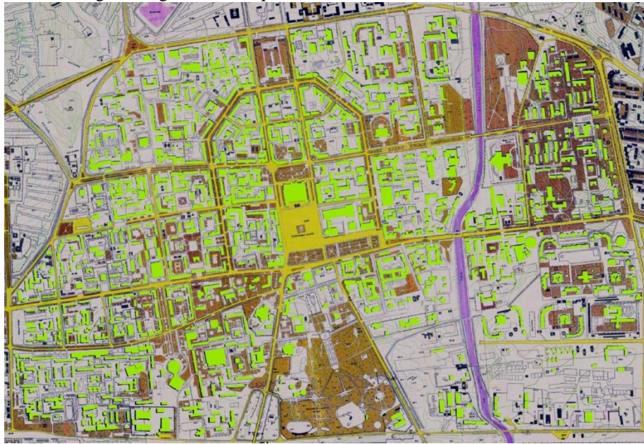
Figure 3. A digitized map of Ikh toiruu, 2000.

and that is the main reason for a rapid increase of the buildings in the city's central area. As seen from the analysis, there were built 792 buildings having 645892.9 sq.m after 1990.