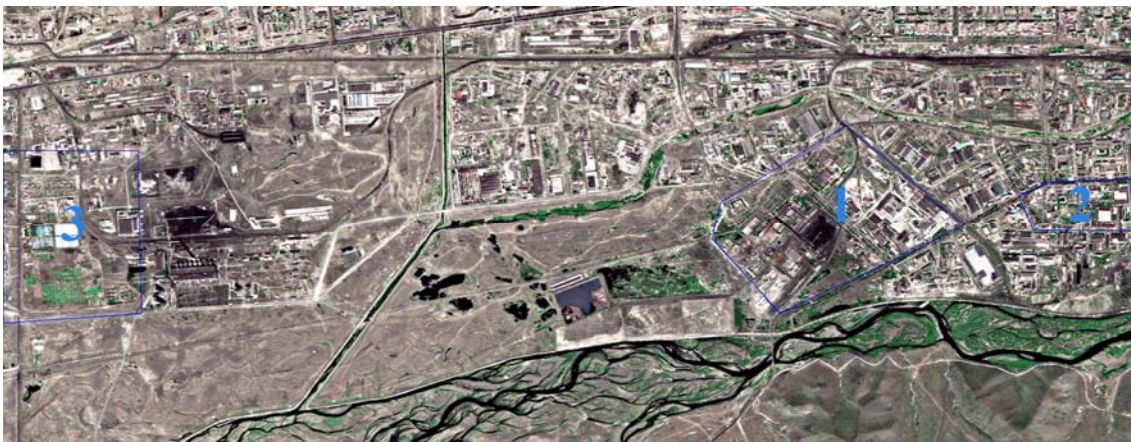
Figure 1. SPOT 5 image of the selected sites (Red=band 1, Green=band 3, Blue=band 2).

In general, in accordance with urban planning strategy, an industrial zone can be subdivided into general industrial, exclusive industrial and semi-industrial zones, while a green zone can be subdivided into green conservation, green natural and green production zones [4,5]. In case of Ulaanbaatar city, it is difficult to distinguish full general industrial area, meanwhile, green conservation and green natural areas are mainly located outside of the city fringe. Therefore, in the present study, we wanted to conduct analyses on the exclusive industrial and semi-industrial as well as green production zones. As the study sites, an exclusive industrial zone situated in the region of the 3 rd power plant, a semi-industrial zone situated near the carpet factory of Ulaanbaatar city, and green production zone situated near the environmental area of Devshil and Agro Amgalan have been selected. The locations of these sites represented in a SPOT 5 image of 2002 are shown in Figure 1.