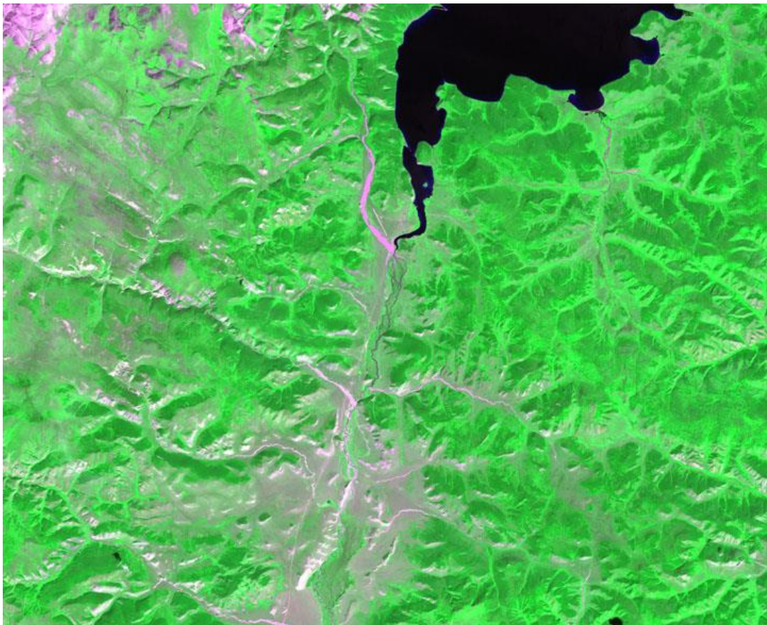
Figure 1. Landsat ETM+ image of the test area.

As a test site, a forest-dominated area around the Khuvsgul Lake located in northern Mongolia has been selected. The area represents a forest ecosystem and is characterized by such main classes as coniferous forest, deciduous forest, grassland, light soil, dark soil and water. As data sources, Landsat ETM+ data of August 2007 with a spatial resolution of 28m, ALOS PALSAR L-band HH polarization image of 17 August 2007 with a spatial resolution of 25m, a topographic map of scale 1:100,000 and a forest taxonomy map have been used. The selected test site in the Landsat ETM+ image frame is shown in figure 1.